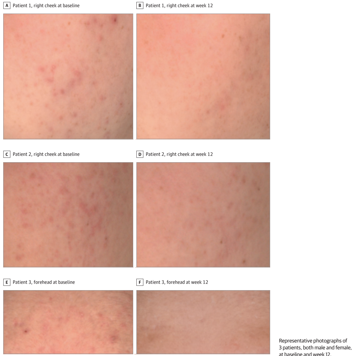
Figure 3. Improvement of Acne in Patients Treated With Clascoterone Topical Cream, 1%, Twice Daily for 12 Weeks

1%, which suggests that the treatment regimen is easy to follow and suitable for general clinical practice. Results of the studies showed positive efficacy outcomes for clascoterone cream, 1%, compared with vehicle, with statistically significant improvements in all primary and secondary efficacy end points.